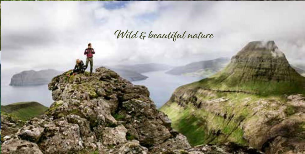
Wild & beautiful nature