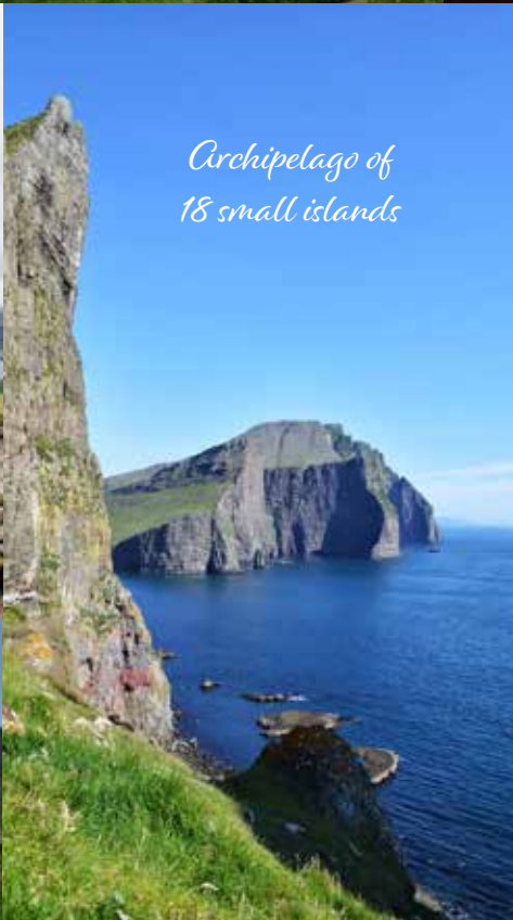
Archipelago of 18 small islands