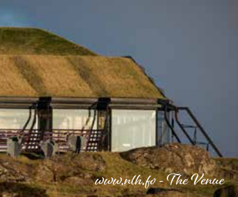
www.nlh.fo - The Venue