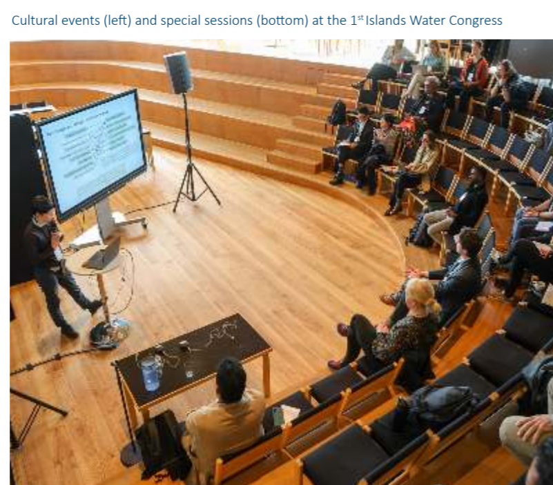
Cultural events (left) and special sessions (bottom) at the 1 st Islands Water Congress